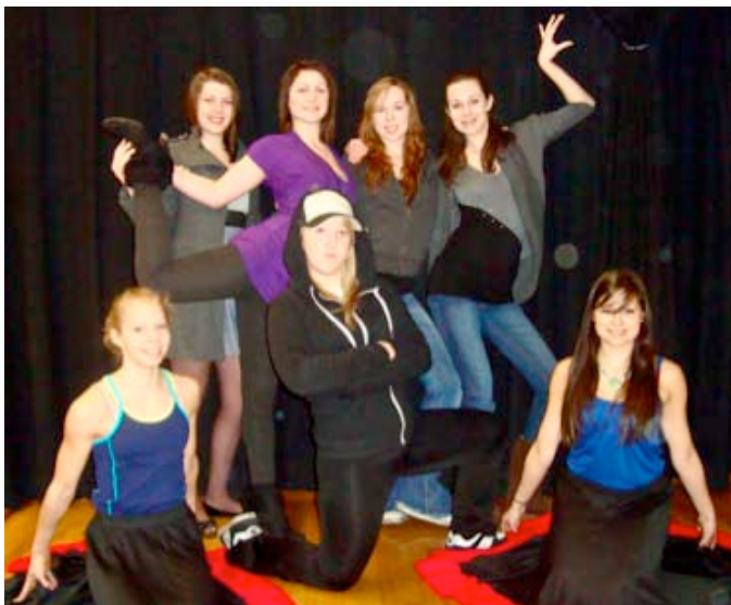
Sr. Dance Students practicing their moves!

Tickets to the show can be purchased in advance ($5) from the dance students or at the door ($8). Doors open at 6:00pm, and the show starts at 6:30pm.